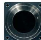
ImSpector N17E spectrograph, front view