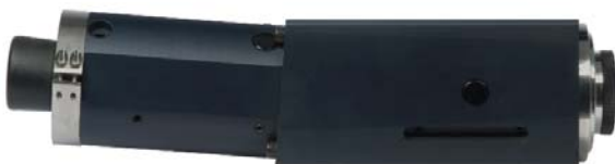
ImSpector N17E spectrograph, side view

More information about fore optics can be found from Hyperspectral fore lenses -data sheet.